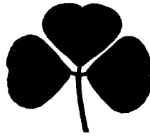
2 triangular to rounded