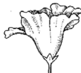
5 wide funnel-campanulate