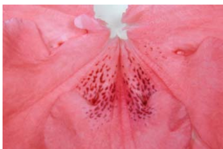
1 spots not touching each other