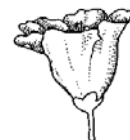
6 medium campanulate