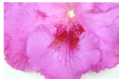
3 blotches surrounded by spots