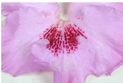
2 spots touching each other