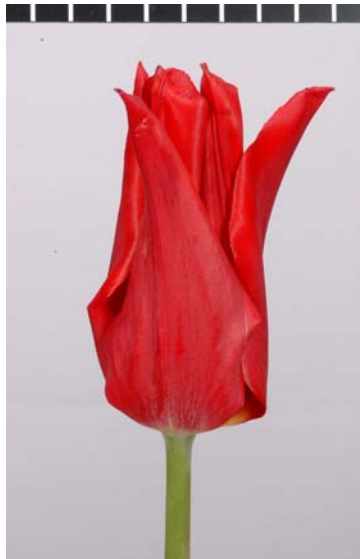
Group 2: pointed and reflexed (Lily flowered)