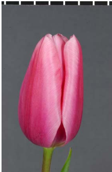
Group 1: convex or flat (Standard)