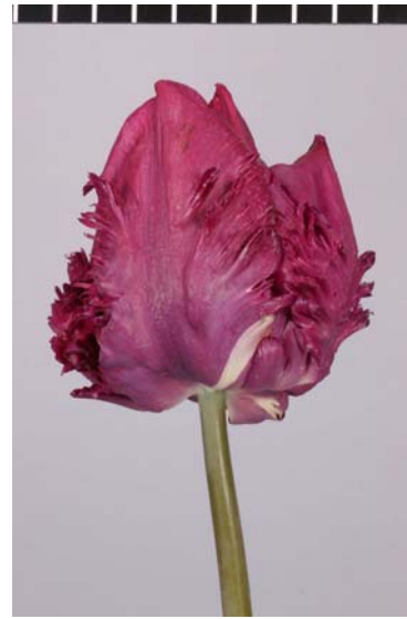
Group 3: lacinate, curled and twisted (Parrot)