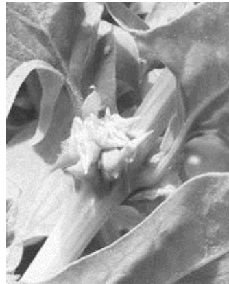
spined pseudo fruit