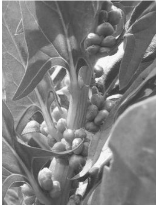
round pseudo fruit

In hybrid varieties, the characteristic may segregate. If the segregation occurs in the predicted manner, the variety should be classified as “plants with round pseudo fruits and plants with spined pseudo fruits” (note 2).