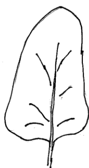
1 absent or very weak