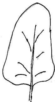
1 absent or very weak