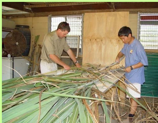
Examining sugarcane on breeders property, Far North Queensland, Australia