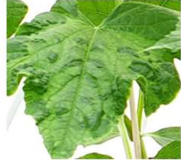
5: strong mosaic, yellowing and distortion of leaf shape