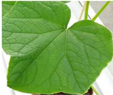
1: no symptoms