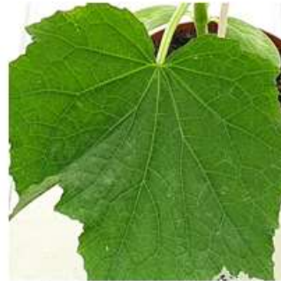
3: mild, localized lesions