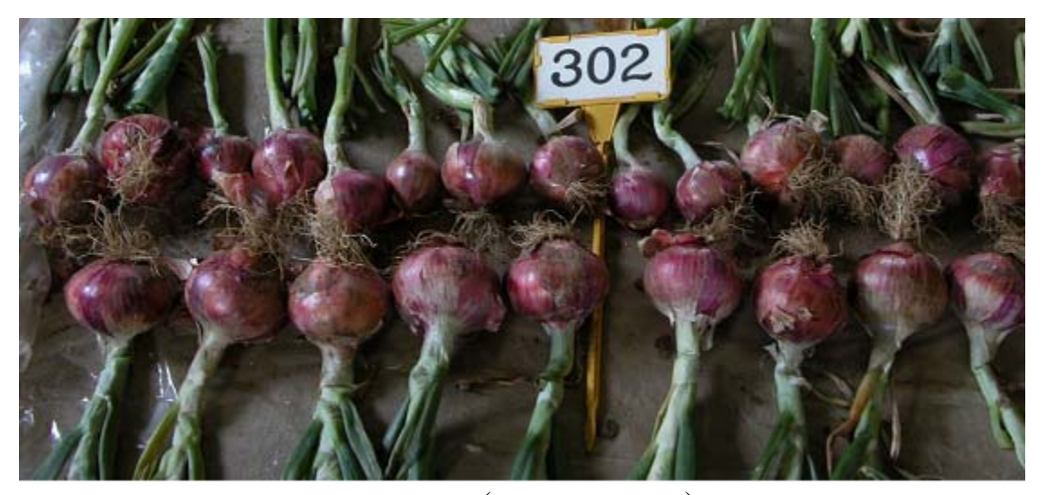
Boradongi (Example variety)