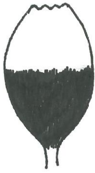
1 basal half

Ad. 29 Drawings to be improved. Main color should appear solid to prevent confusion with drawings for char. 30 and 32.