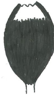
4 basal three quarters and margins