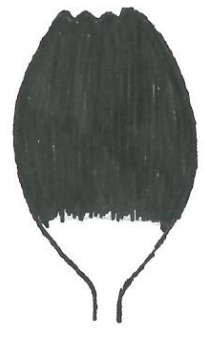
5 distal three quarters