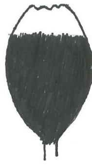
3 basal three quarters