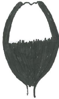
2 basal half and margins