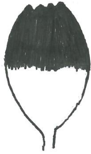
6 distal half