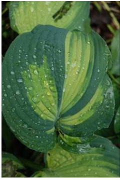
4 in sectors