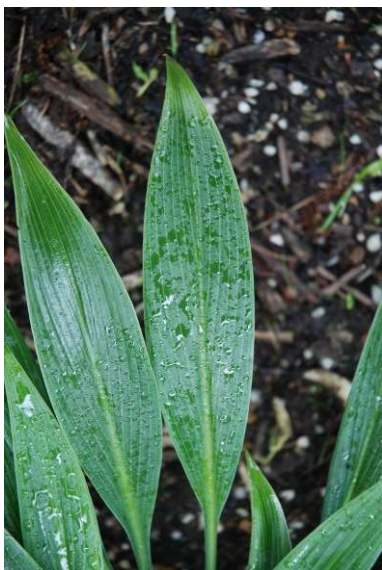
1 absent to very weak