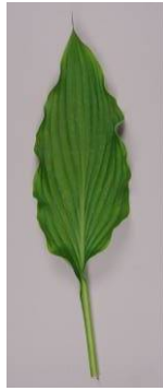
2 narrow ovate