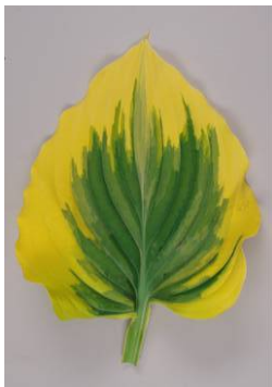
4 broad ovate