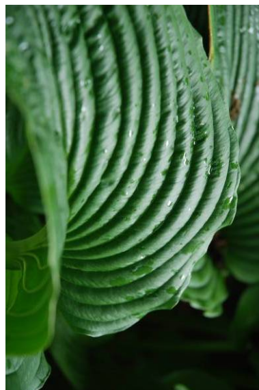
9 very strong