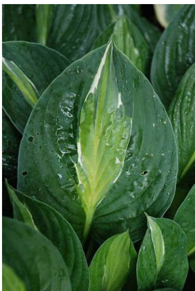
1 absent or weak