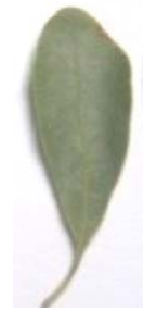
4 broad obovate