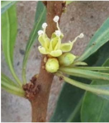
1 on leaves axils