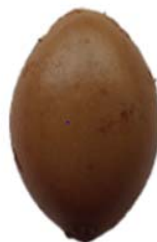
2 broad elliptic