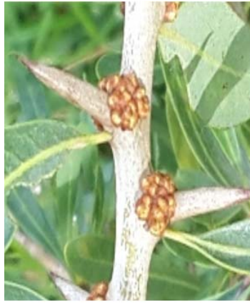
2 on branches