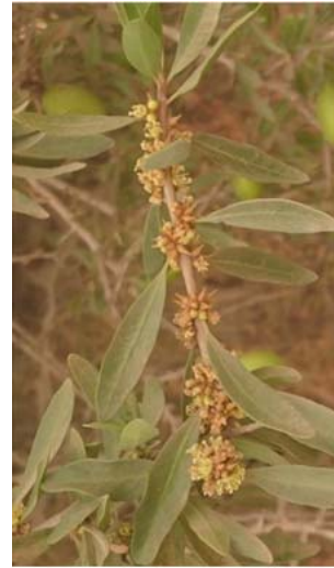
3 on leaves axils and on the braches