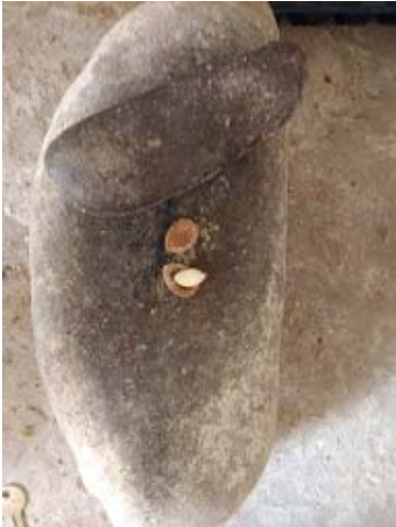
Image of tools used in crushing nuts