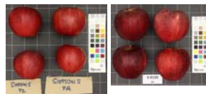
Bellegarde / Angers