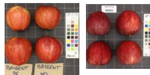
Bellegarde / Angers

⇒ Clear influence of the environment on the phenotype, potentially on distinctness