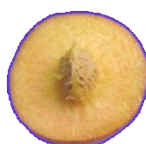
1 absent or very weak weak

Ad. 53 NEW: Only varieties with anthocyanin coloration of flesh in central part of skin: present: Fruit: degree of anthocyanin coloration of flesh in central part of flesh