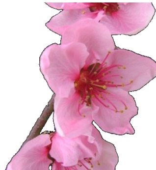
2 rosette (showy)