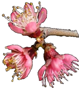
1 campanulate (non showy)

'Rosette' (rose-shaped) is also referred to as 'showy' : these types have large petals.