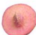
2 weak medium