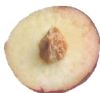
1 absent or very weak weak

Ad. 54 NEW: Only varieties with anthocyanin coloration of flesh around stone: present: Fruit: degree of anthocyanin coloration of flesh around stone