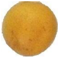
1 absent or very small