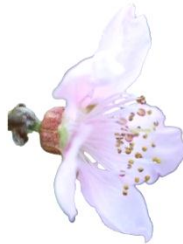
2 at same level same level