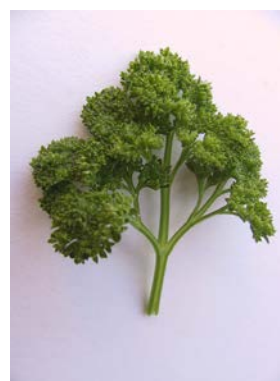
9 very strong