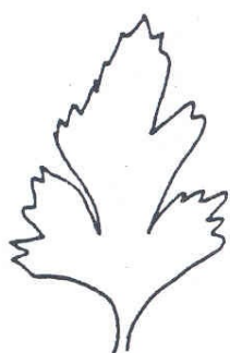
3 narrow triangular