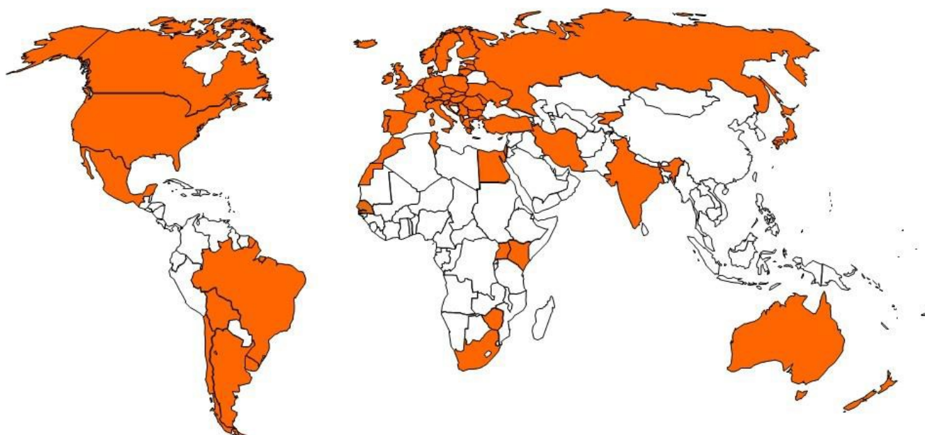
Figure 1 Map of Participating Countries in the OECD Seed Schemes (2016)