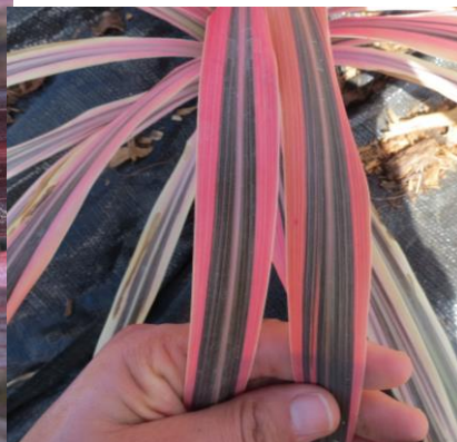
2 margin and middle part