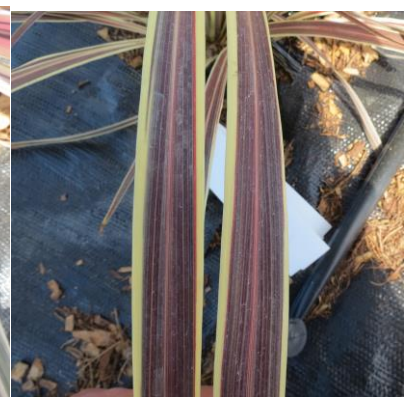
3 mostly margin