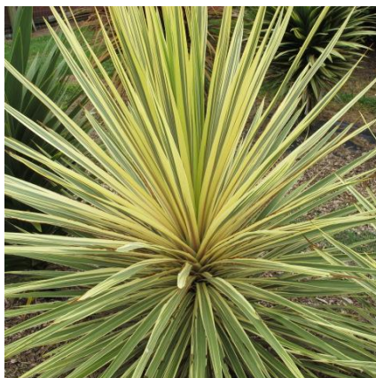
2 upwards and outwards