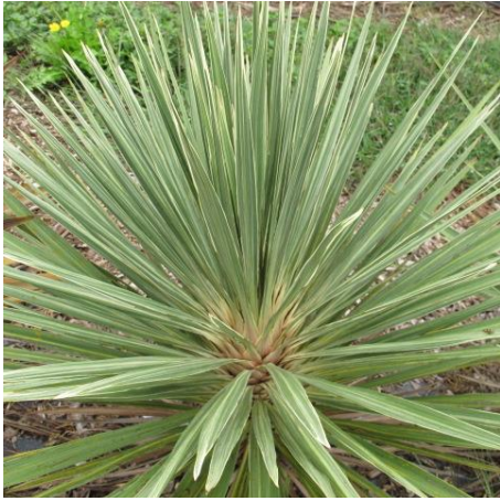
1 absent or very weak