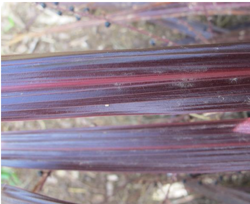
1 mostly middle part

The pattern of secondary color only exists as stripes.