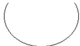
3 strongly concave