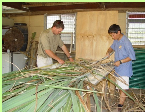
Cooperating with sugarcane breeder, Far North Queensland, Australia