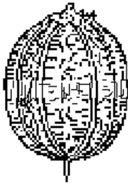
2 broad elliptic