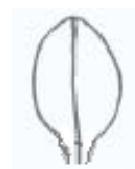
3 broad elliptic