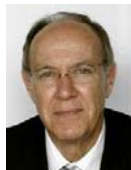
Francis GURRY, Secretary-General