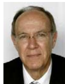
Francis GURRY, Secretary-General