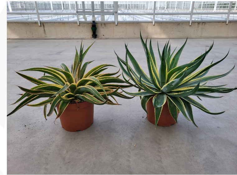
Pairs of same variety grown indoor and outdoor!!