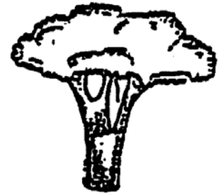
4 transverse narrow elliptic