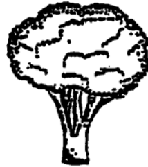
3 transverse medium elliptic