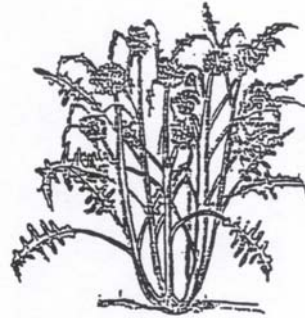
2 more than one