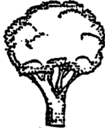
2 transverse broad elliptic