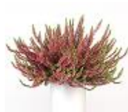
3 broad upright to spreading