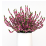
2 broad upright