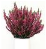
1 narrow upright