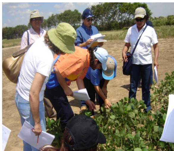
Participants recording data from soybean plots in the field test exercise