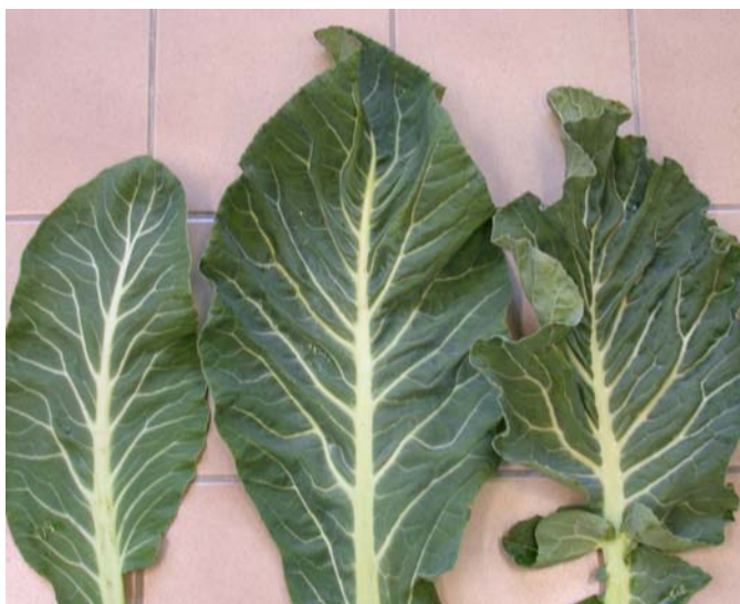
1 absent or very weak 5 medium 9 very strong