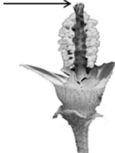
3 clearly above