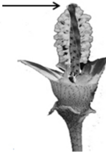
2 same level