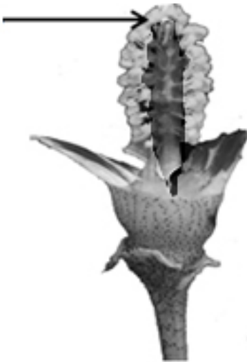
1 clearly below