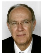
Francis GURRY, Secretary-General