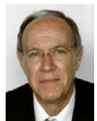
Francis GURRY, Secretary-General